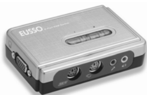
UKS8102-P2B (w/ Audio & Mic)